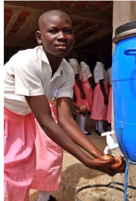
Uganda schoolgirl.

Clean water, safe sanitation and good hygiene are vital to life, health, wellbeing and dignity. We are committed to doing all we can to walk in partnership with those who need us most.