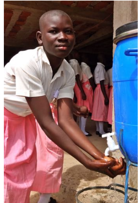
Uganda schoolgirl.

Clean water, safe sanitation and good hygiene are vital to life, health, wellbeing and dignity. We are committed to doing all we can to walk in partnership with those who need us most.