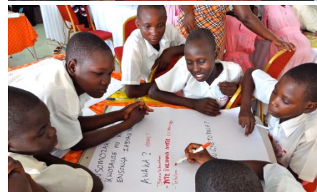
Menstrual health workshop participants, Uganda