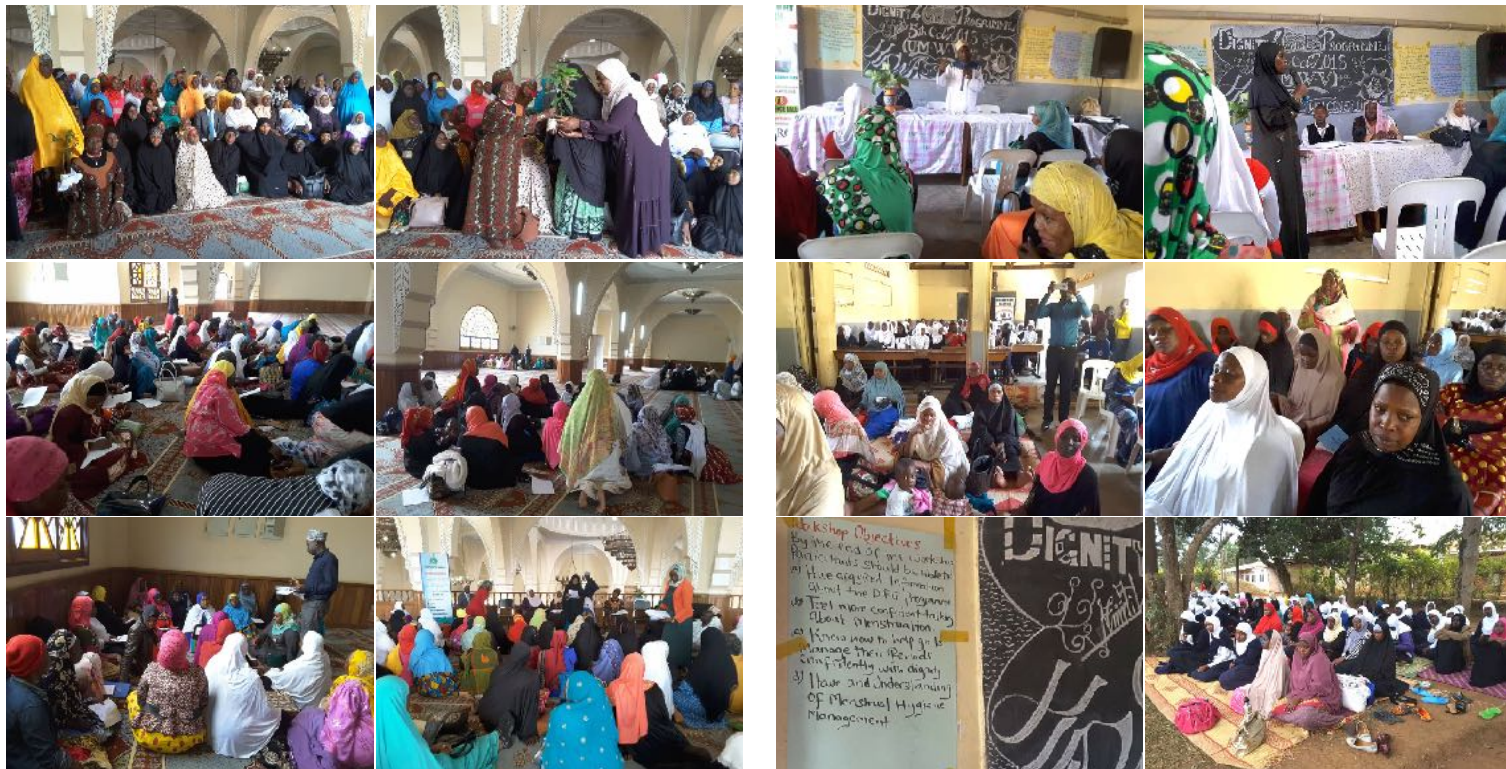
The Uganda Muslim Women Association (UMWA) held a very successful awareness raising meeting on MHM at the National Mosque on October 16 for 116 participants, including eight men and 19 Muslim women leaders visiting from Zanzibar, Tanzania.