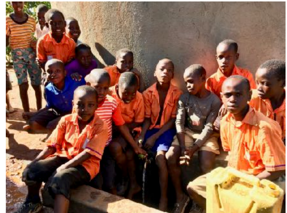
Children at Mende UMEA Primary School enjoy the water from their new rainwater harvesting tank.