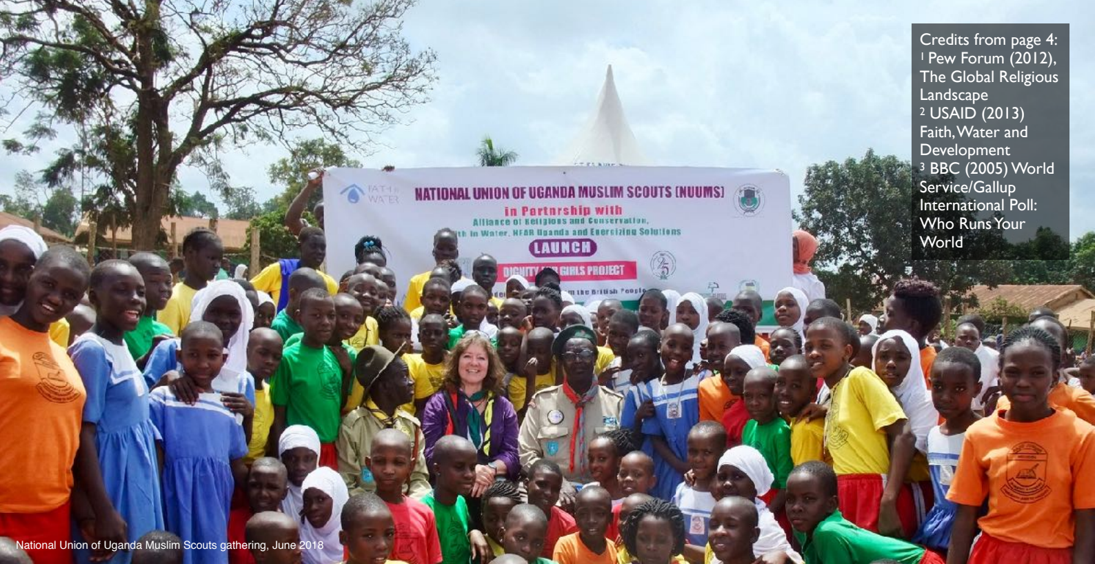
National Union of Uganda Muslim Scouts gathering, June 2018

Credits from page 4: 1 Pew Forum (2012), The Global Religious Landscape 2 USAID (2013) Faith, Water and Development 3 BBC (2005) World Service/Gallup International Poll: Who Runs Your World